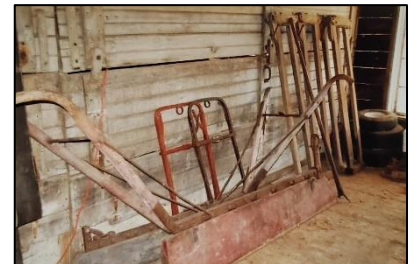
Zander ice harvesting tools, SHS

A fund has been established to restore the Derby icehouse.