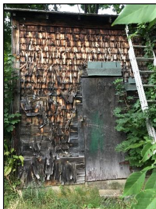
Derby Ridge Farm, Great Road, Stow